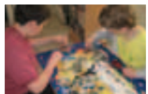
FRIENDS AT HOME